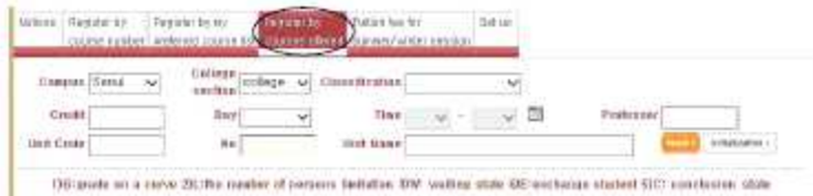
When you select and enter class information such as credit, date, class hour, course title and course area and click inquiry, a course list will appear below the search box as shown in Figure 7. Click the button, 'Registration' on the left. Once you have selected a course, the course title and code will appear in the center of the screen and your timetable on the right as shown in Figure 4.