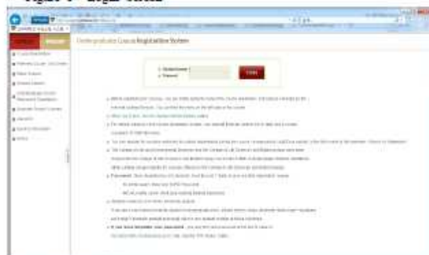
<Figure 1> Login Screen

Note: You cannot register for any course through the Portal system. You must use the above websites.