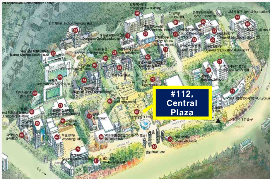
Humanities and Social Sciences Campus (#112, Central Plaza)

Temporary Waiting Area for People with Symptoms (2 Places)