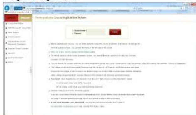
<Figure 1> Login Screen

Note: You cannot register for any course through the Portal system. You must use the above websites.